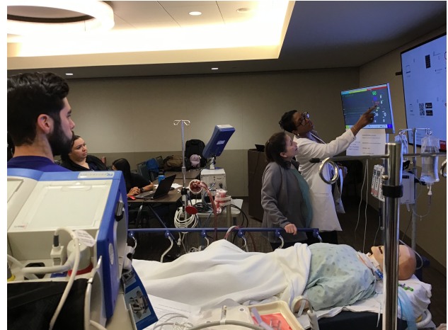
Fig. 1. A nurse educator (human expert) training nurse trainees with the aid of humanoid robot patients.

We anticipate that addressing these challenges in nursing (not unlike other fields of medicine) will involve interdisciplinary solutions that merge expertise from healthcare, human factors, and technology. In particular, we (a multidisciplinary team of nurses, nurse scientists, roboticists, and AI researchers) envision the development of intelligent robotic